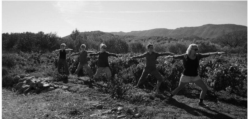
Yoga retreats in beautiful places, like this one in Croatia, draw customers from all over the world.

If you aren't lucky enough to have dual citizenship (like Evening does), in addition to starting your business as described above, you'll also need to complete the added steps of registering yourself as self-employed and applying for residence (see sidebar).