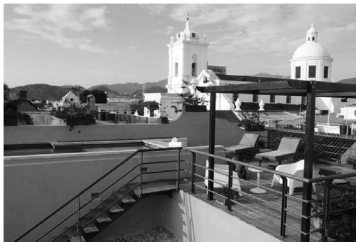
Converting the rooftop of a colonial building into a small pool area added to the attraction of Casa del Farol in Colombia.

It was also while traveling that Sandra and Angel decided they wanted to run their own boutique hotel. When a friend suggested that Colombia was a good bet, they decided to pay it a visit.